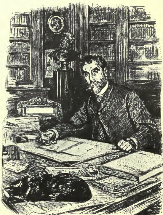
LUDOVIC HALÉVY IN HIS STUDY, WITH HIS BLACK CAT ON THE TABLE